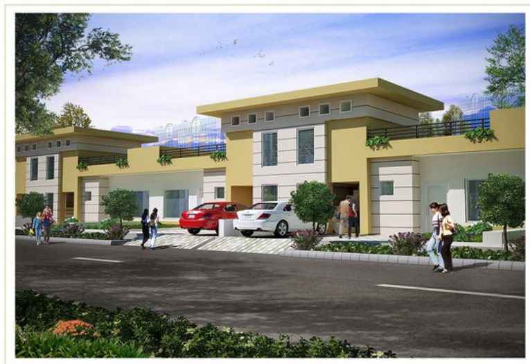
168.75 Sqmt. 3D Perspective View(Total Build Up Area 1400sqft,Approx)