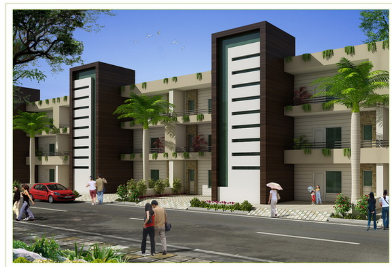
126 Sqmt 3D Perspective View (Total Build Up Area 1127 sqft, Approx)