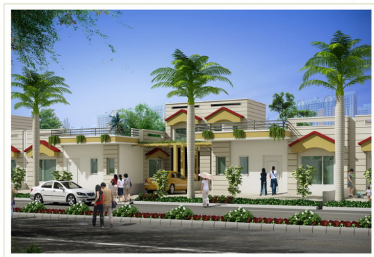
253 Sqmt. 3D Perspective View(Total Build Up Area 2100sqft,Approx)