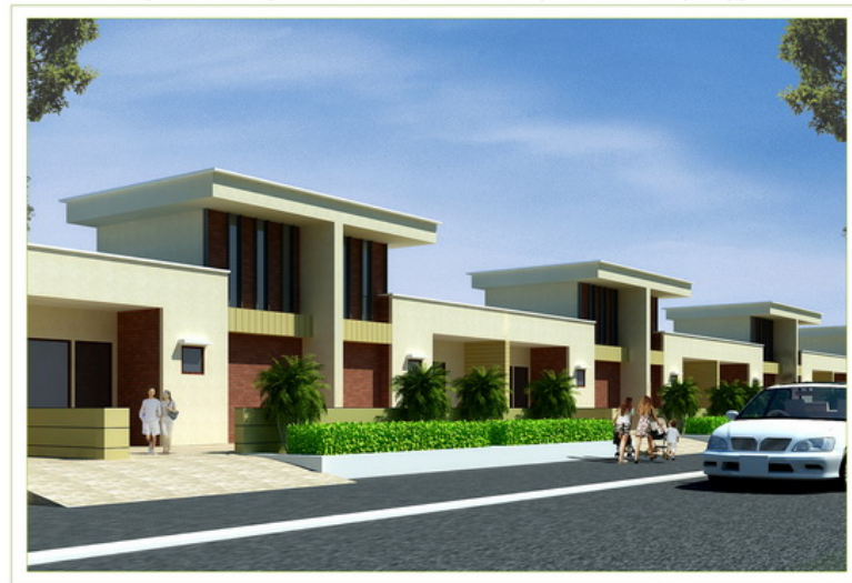
126Sqmt.3D Perspective View(Total Build Up Area 1250sqft,Approx)

2Bed room 1 Drawing & dining room 2 Toilets 1 Kitchen Drive way with cotta stone Boundary wall with gate Staircase