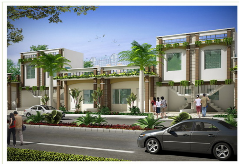
105 Sqmt. 3D Perspective View(Total Build Up Area 950sqft,Approx)