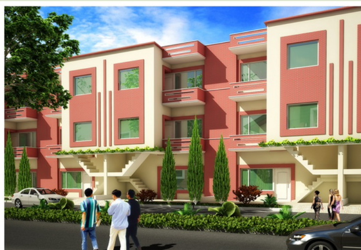
84 Sqmt 3D Perspective View (Total Build Up Area 815 sqft,Approx)

2Bed room 1 Drawing & dining room 2 Toilets 1 Kitchen Drive way with cotta stone Boundary wall with gate Staircase