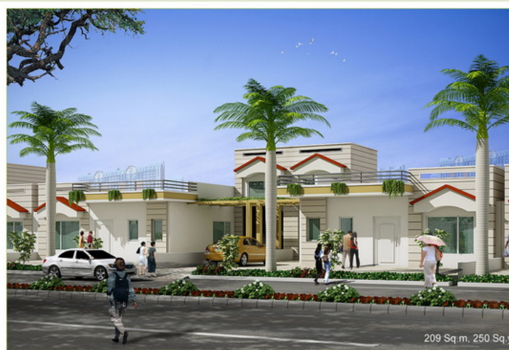
209 Sqmt.3D Perspective View(Total Build Up Area 1900sqft,Approx)